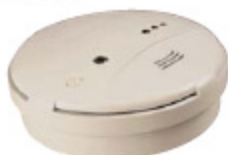
HPM 240V Smoke Alarm

You cannot rely on your sense of smell to wake you up. Smoke alarms are an essential part of household safety. Battery operated models are inexpensive and easy to install. For complete protection, you need to have several alarms installed throughout your home – particularly near all bedrooms. Remember to test your smoke alarms regularly. Some smoke alarms feature a battery level touch test device to ensure batteries are still operational. Other models emit an intermittent tone when their batteries are low.