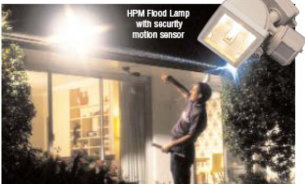
HPM Flood Lamp with security motion sensor

Exterior flood lamps that are activated by motion are a great safety and security measure. Not only do they light the way when you come home after dark, they are a welcoming light when someone comes to your door at night – and you can see who is there. Placed strategically around your house, motion sensor flood lamps will alert you if any unwanted intruders are prowling around, as well as providing a deterrent.