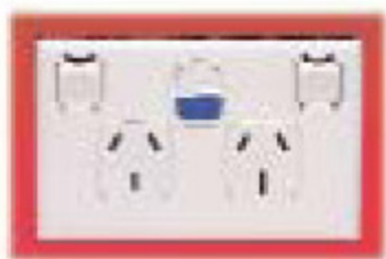
HPM Electresafe Powerpoint

Safety switches monitor the power flow into a circuit through an active wire and back through a neutral wire to detect any imbalance. An imbalance will cause the safety switch to disconnect the power in one thirty thousandth of a second.