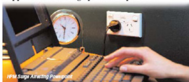
HPM Surge Arresting Powerpoint

Electrical surges can instantly damage electronic equipment, but you can protect your valuable appliances with surge protection products.