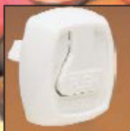
Safety Plugs prevent curious toddlers from inserting objects into power points