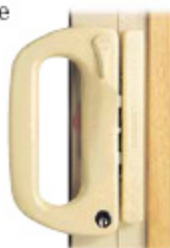
Lockwood Macquarie Door Lock with Safety Release

It's also a good idea to rehearse a fire drill with your family – particularly children. Make sure they know to keep low and where the nearest exit is to their bedroom. If you have deadlocks fitted, make sure they are the type with a safety release, so that you minimise the chance of being locked in.