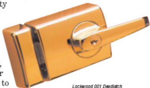
Lockwood 001 Deadlatch with lever

All exterior doors should be fitted with deadlocks. Make sure that the one you choose has a safety release so that you can't accidentally lock yourself in. For added personal security, spyholes and door guards allow you to screen your visitors.